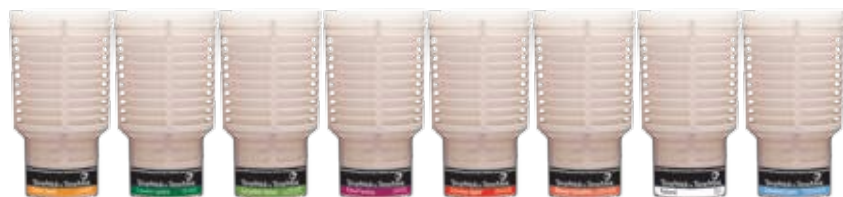
Citrus Twist 67-6108TM Country Garden 67-6122TM Cucumber Melon 67-6110TM Floral Fantasy 67-6109TM Luscious Apple 67-6101TM Mango Smoothie 67-6160TM Natural 67-6140TM Sundried Linen 67-6111TM