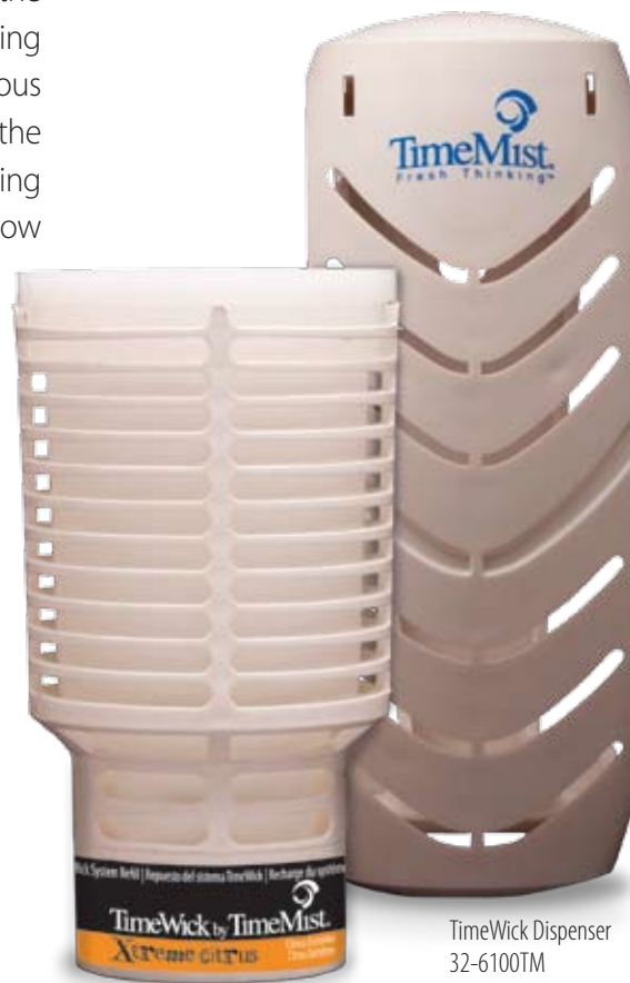
TimeWick Dispenser 32-6100TM Xtreme Citrus 67-6115TM